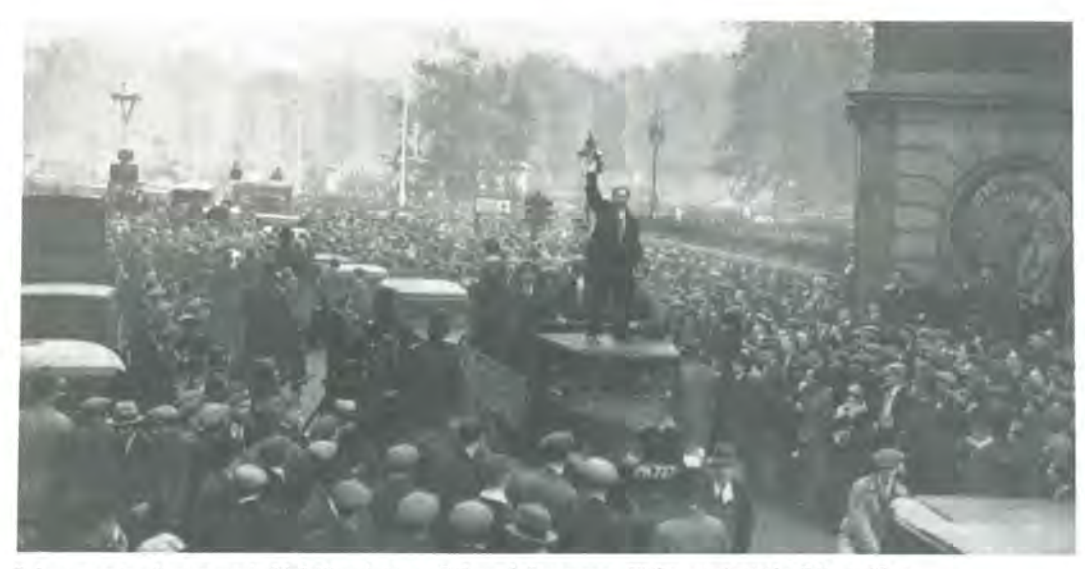
Below, centre foreground: Wal Hannington. Below, left corner: Fights against the Means Test.